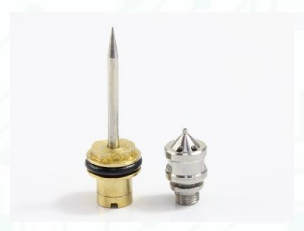
Needle + Nozzle $10 per set